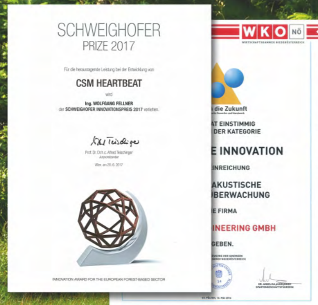
The patented CSM Heartbeat system was awarded with innovation prizes by Schweighofer and the Lower Austria Chamber of Commerce.