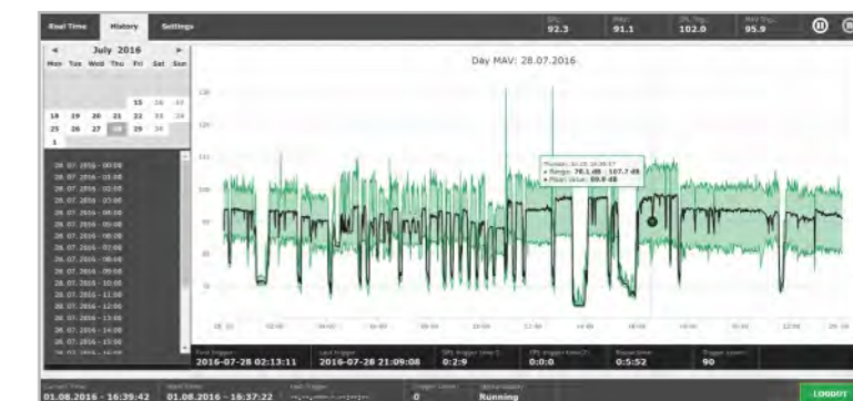
One day record of MAV (Moving Average) indicates the wear of the saw blades. It is a sign of increasing wear if the MAV rises. Thus the optimum time for changing the saw blades can be determined.

Return on investment (ROI) guaranteed in just a few months!