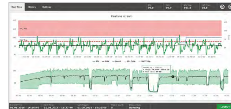
SPL measurement (upper trace): At 16:35:59 the noise level exceeds the set limit value (red zone), immediately the system briefly decelerates the feed rate. Therefore any damage to the saw blades is prevented. Lower curve (green zone): history.