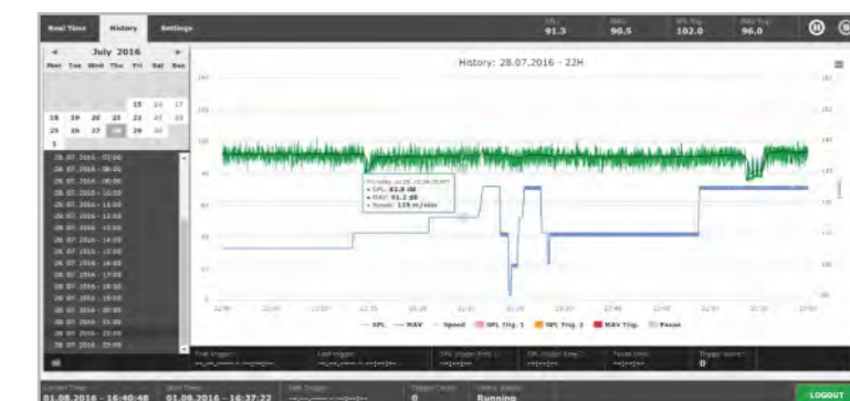
History of CSM Heartbeat. Sound pressure level, average value and feed rate within 1 hour.